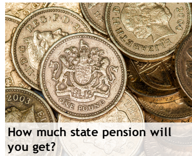
How much state pension will you get?