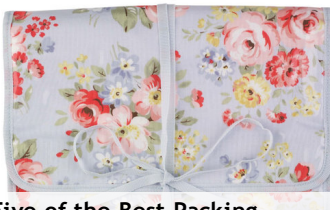
Five of the Best Packing Organisers