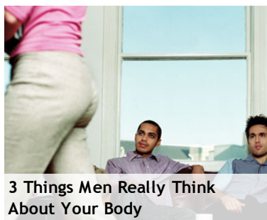
3 Things Men Really Think About Your Body