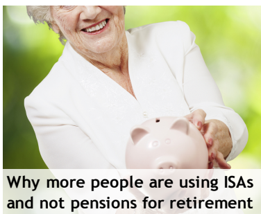
Why more people are using ISAs and not pensions for retirement