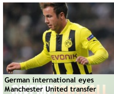
German international eyes Manchester United transfer